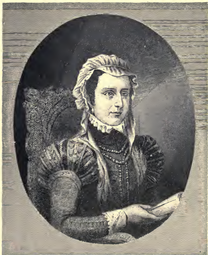
MARGARET OF PARMA, REGENT OF THE NETHERLANDS.